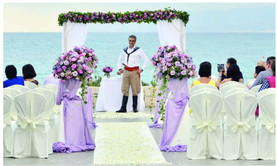
The Cochlias Terrace