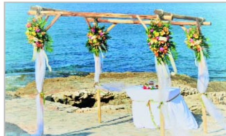
Plakoura Area ceremony venue - right by the waterfront